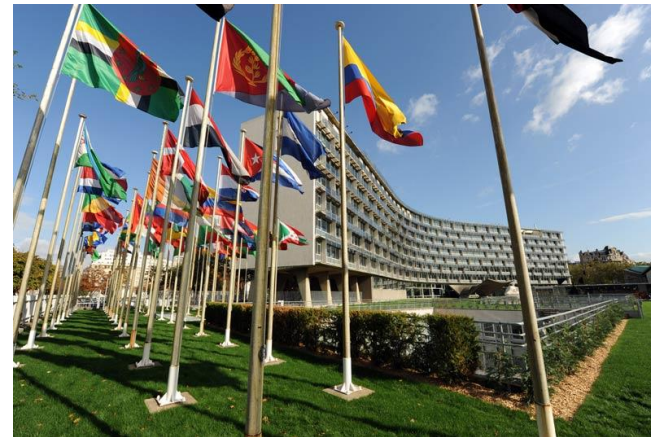
UNESCO in Paris