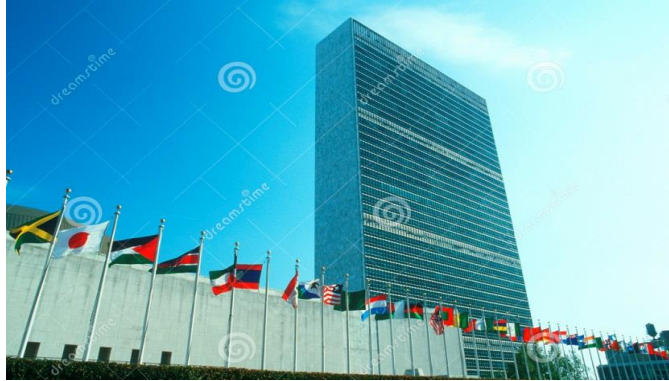
UN Main Office New York