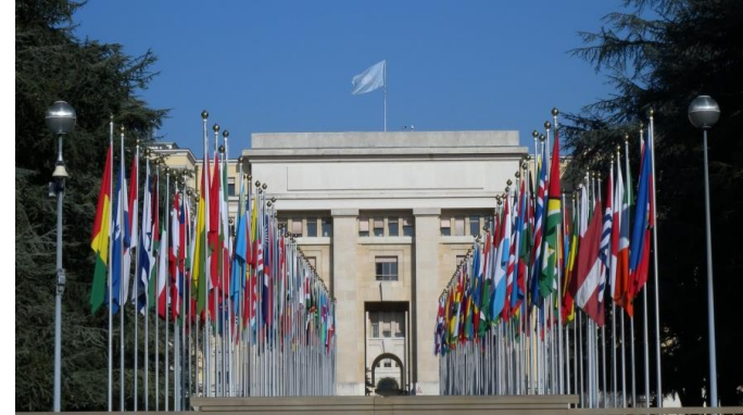
Palace of Nations Geneva; also ILO