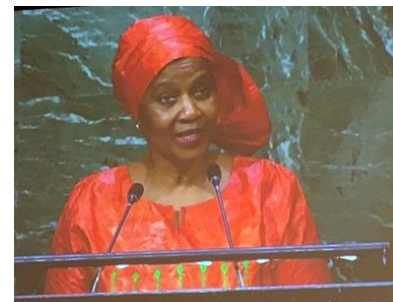
Under-Secretary-General Pfumzille Mlambo Ngzuka & Executive Director