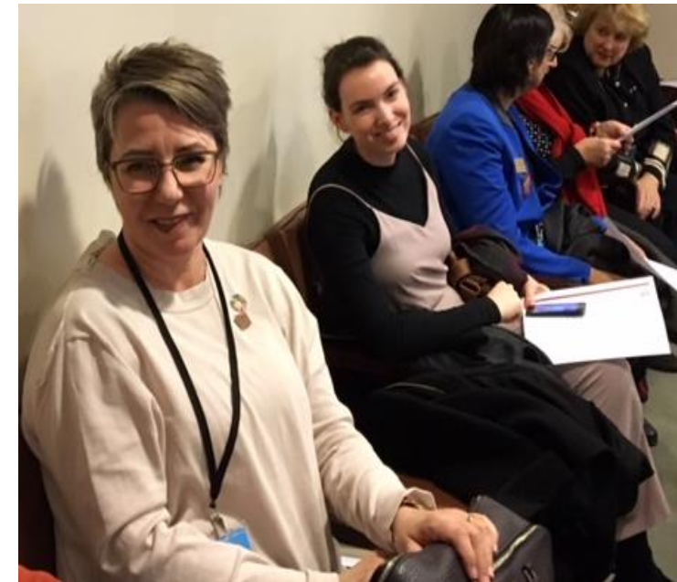
D-13 Zontians in CSW 2017: Governor Ingibjörg Eliasfottir and Cecilie Gulbrandsen, Stavanger Zonta Club.

The NGOs are important for critical evaluation of progress or lack of progress. Stronger obligation for the nations is necessary to fulfill the SDGs and the Beijing Platform for Actions from the 4 th UN Women Conference.